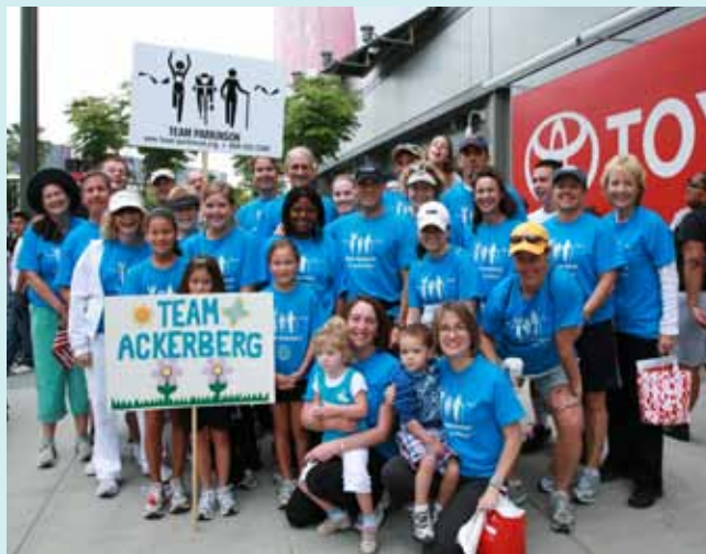
Ackerberg Team at the Los Angeles Marathon