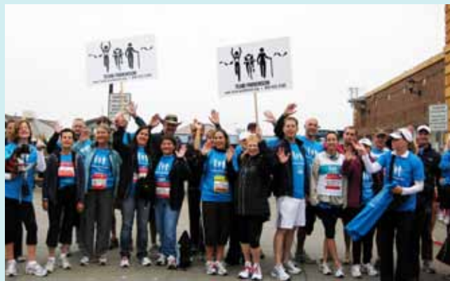
Team Parkinson at the San Francisco Marathon